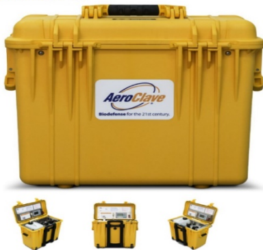
RDS 3110 Total Asset Decontamination

To request the use of the AeroClave RDS 3110, contact the Emergency Health Services Federation at 717-316-8173 .